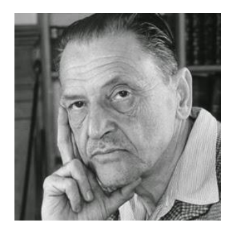
Writer Somerset Maugham