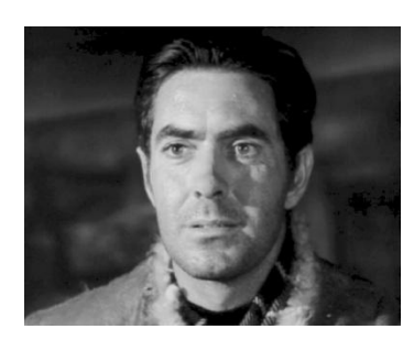
Actor Tyrone Power